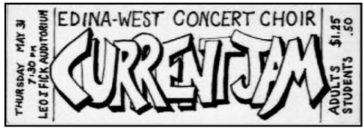
A ticket from the first Current Jam on May 31, 1973.