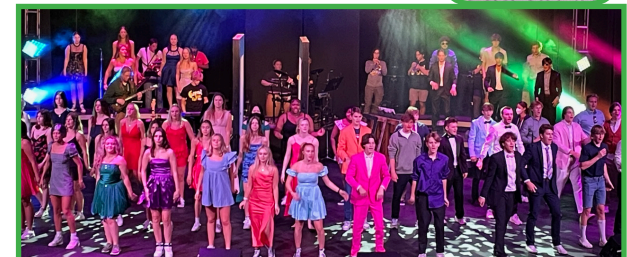
Current Jam , an Edina institution for 50 years!